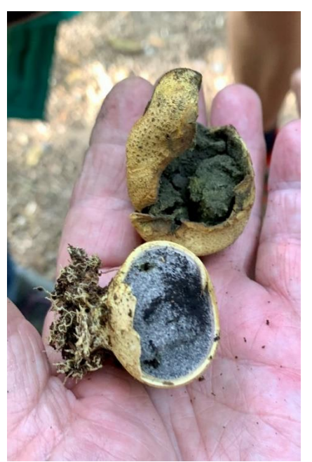
Comparing fungi - puffball and earthball

Please note, some of our common fungi are toxic so please be careful.