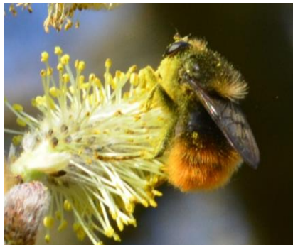
Pic.2. Criorhina ranunculi on Sallow (Fekete, 2019)

...to read the rest of this paper and see the beautiful photos please visit www.foabw.uk (under Surveys)